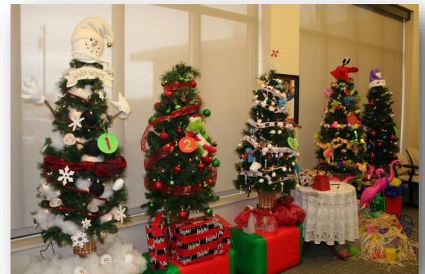
Tree #3 Rawlins Clinic and Providers